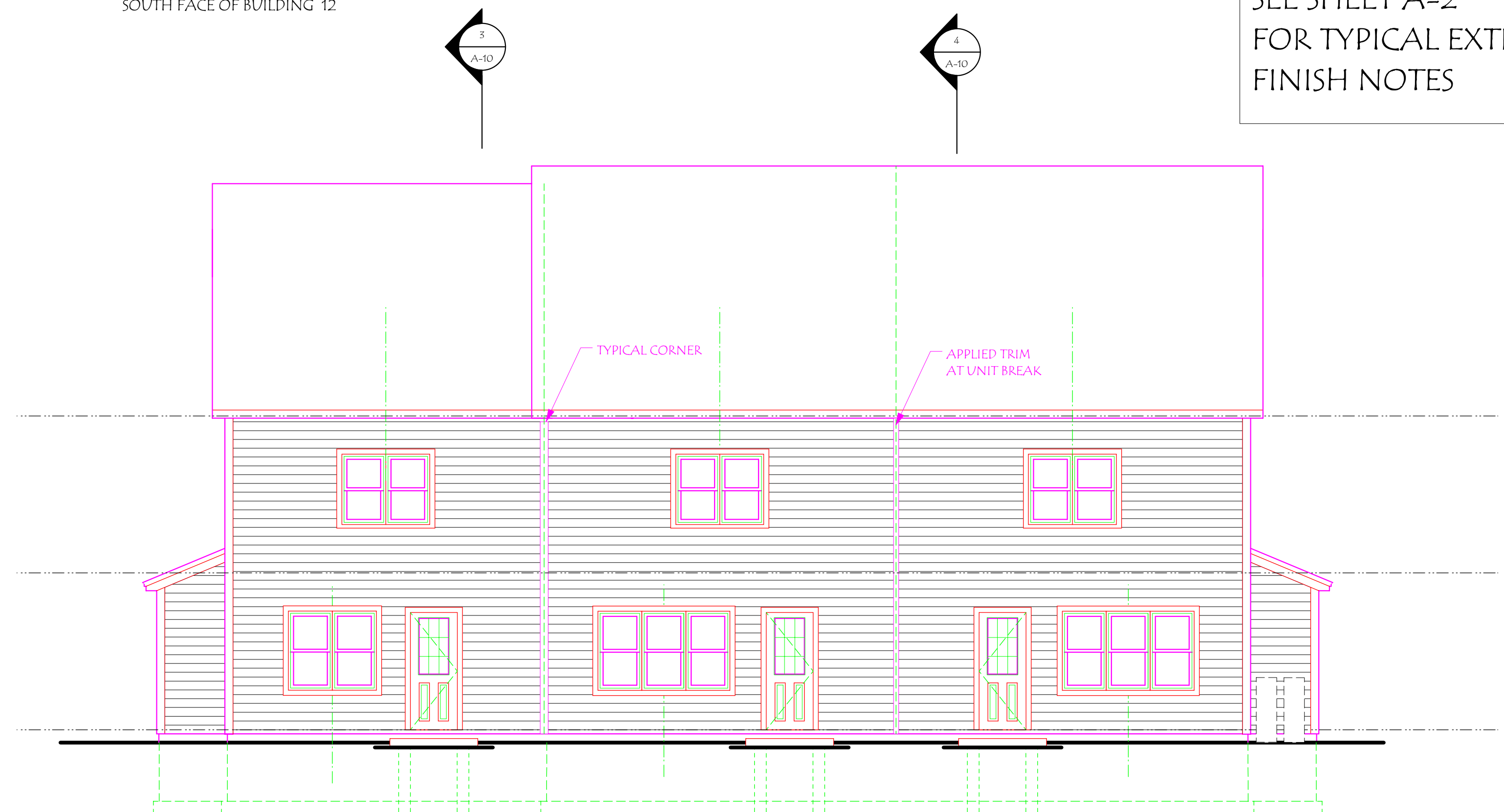
4 BACK ELEVATION / BUILDING TYPE 3 Scale: 3/16" = 1'-0"

NORTHWEST FACE OF BUILDING 6 EAST FACE OF BUILDING 12