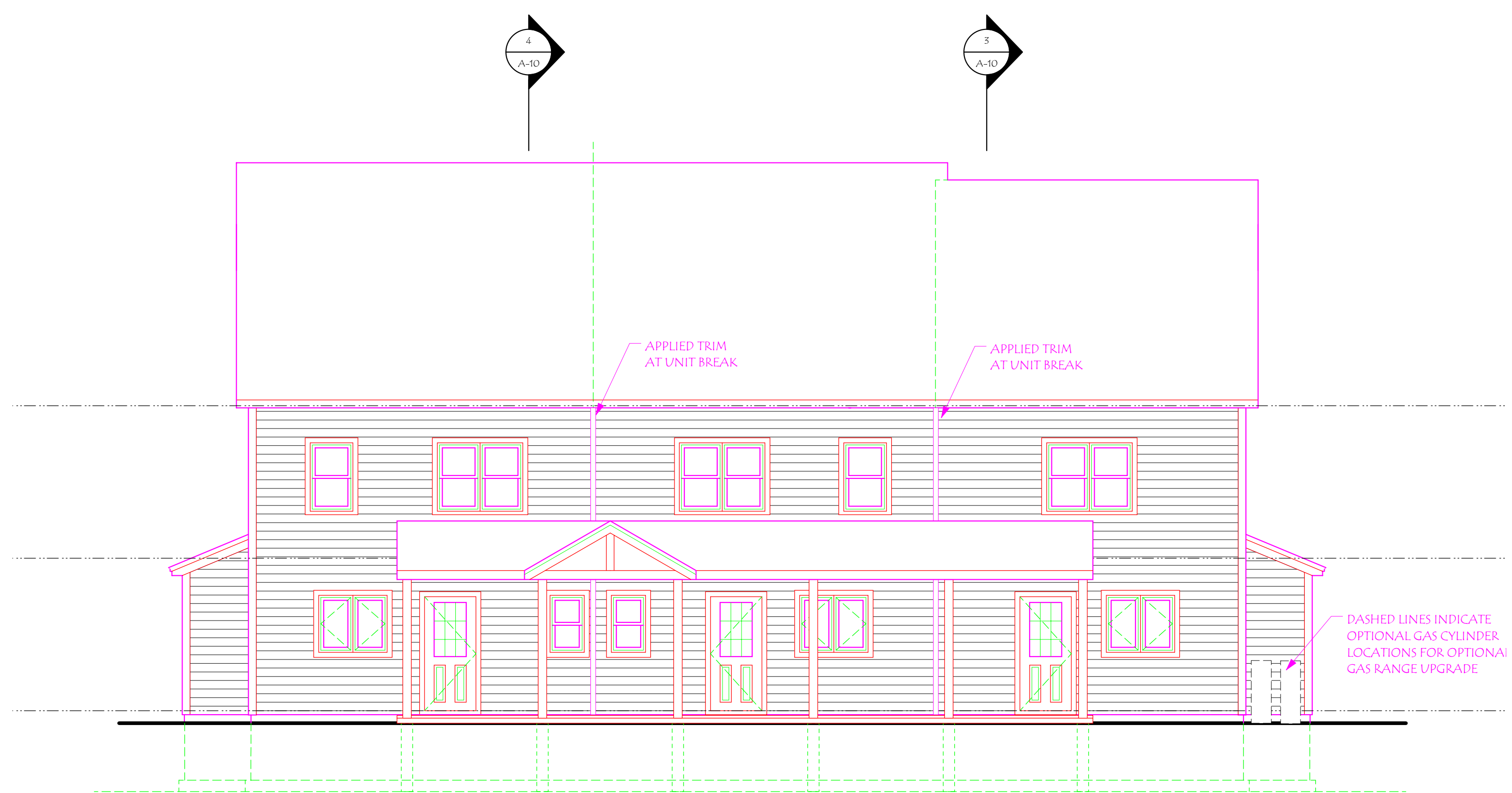
1 FRONT ELEVATION / BUILDING TYPE 3 Scale: 3/16" = 1'-0"

SOUTHEAST FACE OF BUILDING 6 WEST FACE OF BUILDING 12